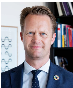
Jeppe Kofod Minister of Foreign Affairs

With this strategy, we are for the first time defining a united direction for Denmark's export efforts within the water sector. The ambition is to maintain the progress we have made in recent years and for Denmark to remain a pioneering country as well as utilise its strong position in the water sector in order to further increase the export of water technology. We are very pleased that the entire water sector has participated actively in the work, so that we have been able to develop a common platform for further strategic cooperation.