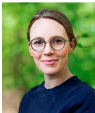
Lea Wermelin Minister of Environment