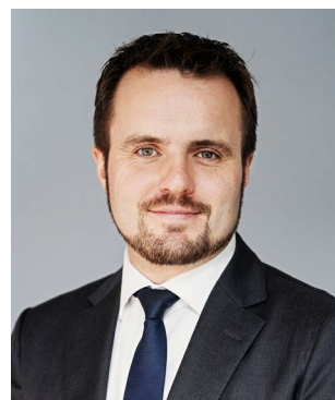
Simon Kollerup Minister of Industry, Business and Financial Affairs